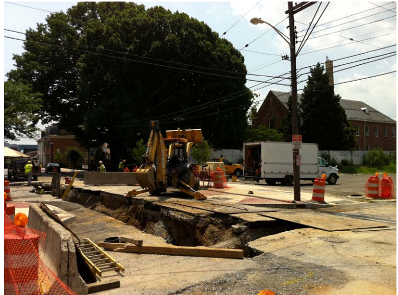
Sidewalks were first and now the water and utilities are being prepared. Construction will soon begin on the first phase of the project which will ultimately add 200+ homes.

The rebuilding of our neighborhood provides a unique opportunity for St. John's and our vestry is looking for ways that we can prepare for the future. We'd like your thoughts on things that should be done.