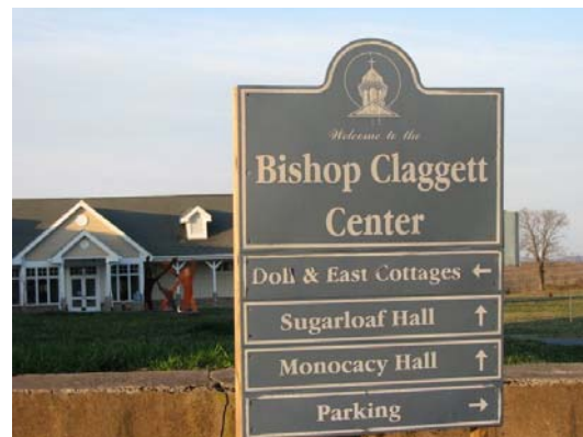
Bishop Claggett Center in Maryland provides a convenient location for our annual retreat.

We are fortunate to have this Episcopal facility available to us in close proximity.