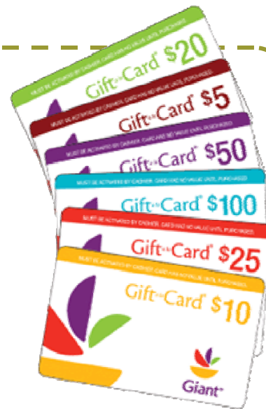
Purchasing gift cards is an easy way to support our outreach with out having to spend extra money.

Janifer Nolte and Kendall Menzer have endured all sorts of weather conditions to sit in front of the church on Sunday morning offering us an opportunity to support a valuable ministry of the parish. If you have not done so, please remember to thank them.