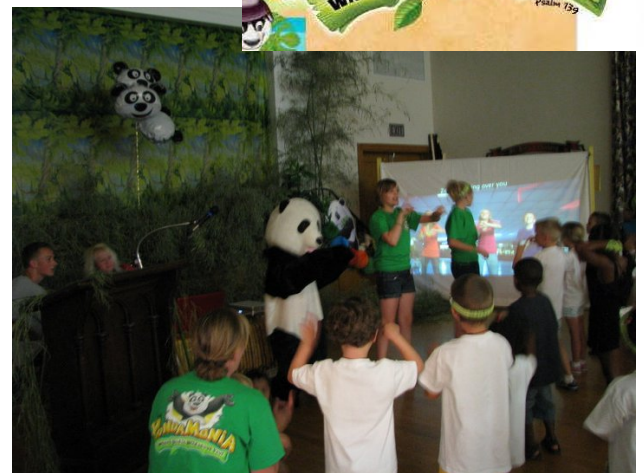
PandaMania provides exciting connection to Christian education.