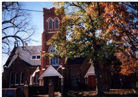
Like any historic site, .....Our stewardship goes beyond the operating costs of the parish and ministry to the larger community. We are stewards..... leaving the church buildings in good repair for future generations is part of our call to be good stewards. We have much to be grateful for at St. John and the beauty of the buildings we occupy is a blessing.

We are fortunate to have received a grant for $130,000 to cover the majority of the cost of the project. The Vestry approved covering the additional costs with income from the real estate investment fund.