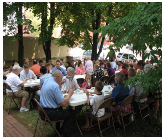
Lunch on the lawn on a beautiful summer day gave everyone a chance for fellowship.

At St. John's, we use the feast day for fellowship. A picnic lunch on the lawn is a great opportunity to share a meal with our parish family.