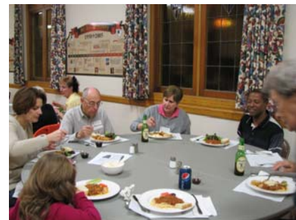
Connections is intended to strengthen friendship bonds of the parish.

On Sunday morning there is little time to do more than greet people. Connections is intended for us to get to know each other better and to include all ages. We talk about parish families but many events segregate us by age group. Connections is intended to provide an opportunity for all of us children and grandparents alike to come together, share a meal and enjoy a good time.