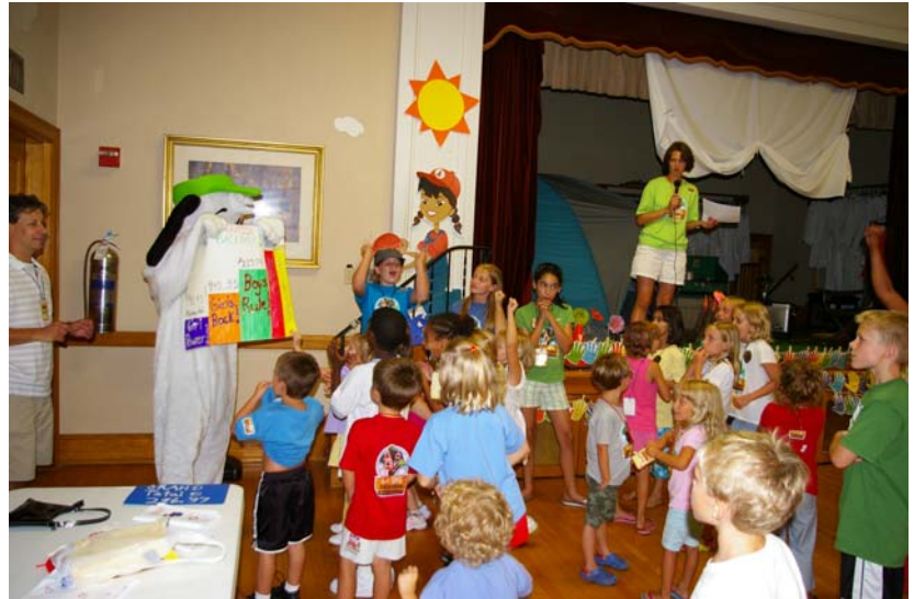
Vacation Bible School gives children an opportunity to explore Christian education in a fun and engaging way.