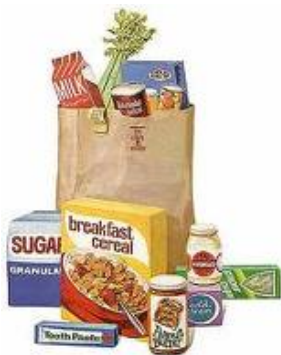
It's a sad fact that every day people in our community go hungry.

St. John's Food Pantry provides three days worth of food for families and individuals referred by the York County Clearing House. Any persons in need including the homeless are always welcome. The pantry is made possible by your contributions both in groceries, money, the sale of gift cards and the outreach ministry.