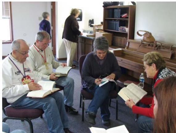
This bible study took place at the parish retreat in April. The regular bible study group meets after the Wednesday morning service in the Rector's study.

This is another ministry available to the congregation and all are encouraged to attend.