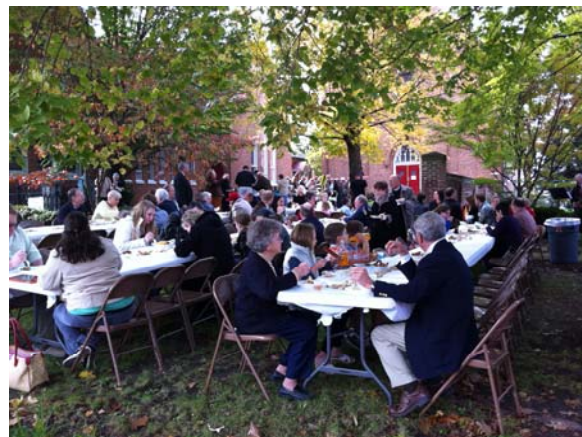
Nice crowd on the lawn for “brats and brew”

In addition to great food and fellowship it also gave us a chance to launch our fall time and talent appeal. We used the “This is my church” theme and passed out the time and talent surveys.