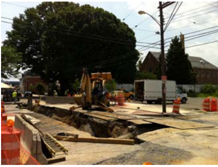
Construction on Beaver over the summer highlighted the changes coming to our neighborhood.

Over the past decade it is clear that our church membership has been declining. There is no question that nationally there is a trend in church declines, so it is fair to say that we are not alone. However, in our parish it is also due to an aging parish population. We have a choice, do we continue to decline and therefore continue to reduce our expense structure, or do we make a strategic effort to reverse this trend?